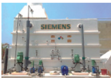
FIGURE 1. Scrubber.

The use of conventional chemistry in the Scrubber operation, made maintenance costs by corrosion higher; these had to be done every 6 months and they were rigorous, the pH and ORP sensors (oxide potential reduction) had to be calibrated continuously, and the water of the recirculation tanks was changed frequently by the formation of creams on the surface.