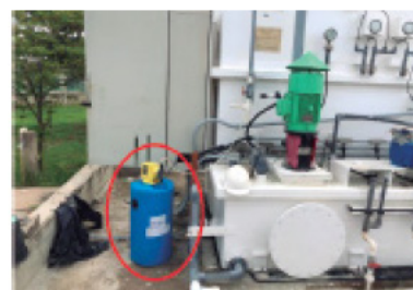
FIGURE 3. BOC storage and dosing tank.