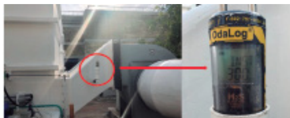
FIGURE 4. Scrubber entry (left) and measurement of H 2 S with OdaLog equipment.

It should be noted that the implementation of a solution using biotechnologies has other benefits such as savings in dosing equipment and infrastructure. The storage and dosing of large amounts of soda and hypochlorite required a system and infrastructure that takes up a lot of space (Figure 2). In contrast, the dosing and storage system for the BOC is reduced to tanks that require less space (Figure 3).