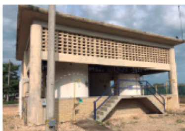
FIGURE 2. Storage tanks for conventional chemistry product.