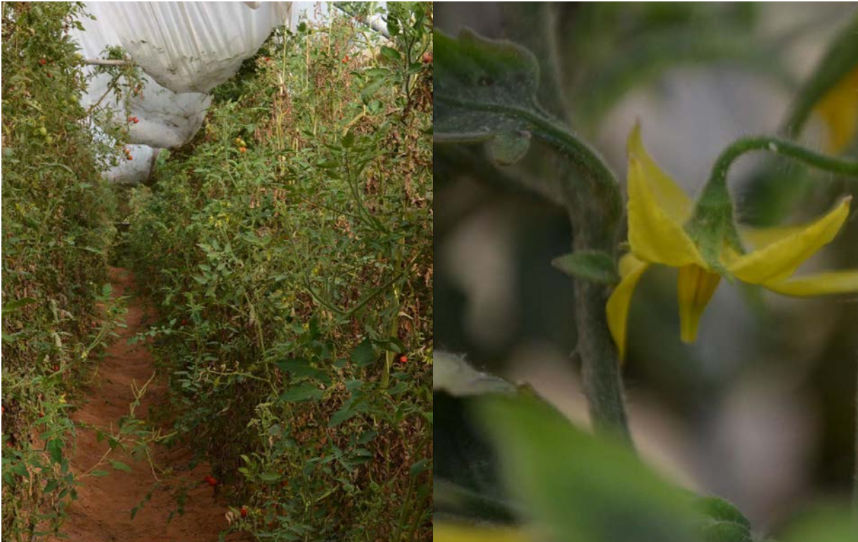
Month 7, Non dosed crop