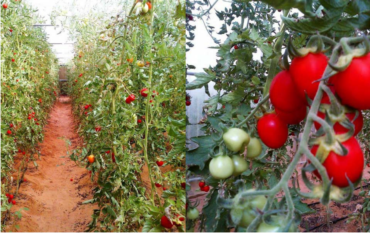
Month 5, Non dosed crop