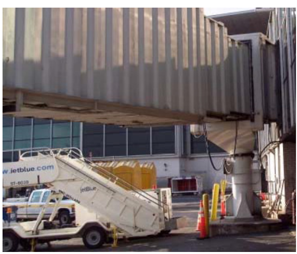
Before BOC Cleaning.

Project Goal: Reduce TPH (Total Petroleum Hydrocarbons) in storm water run off into local water ways.