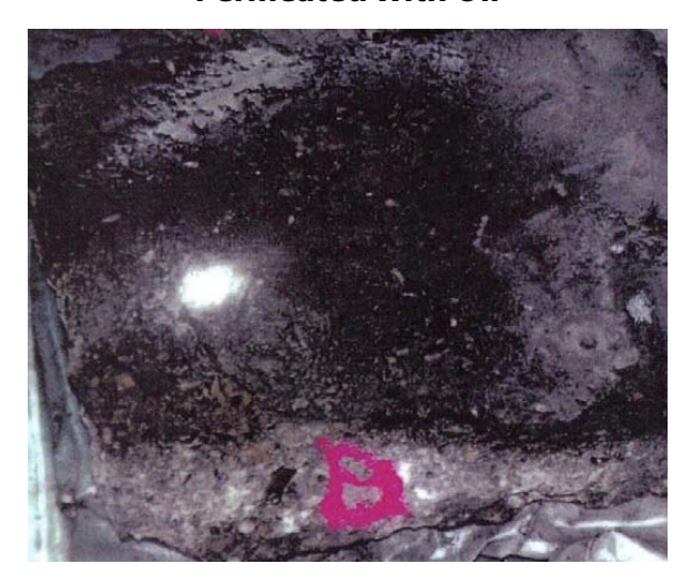
Top View Of Concrete Permeated With Oil