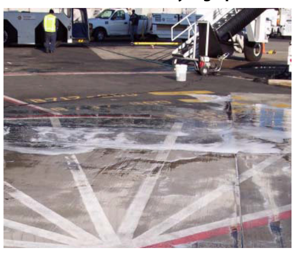
After one application.